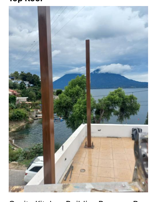
Casita Kitchen Building Progress Report November 30 2024