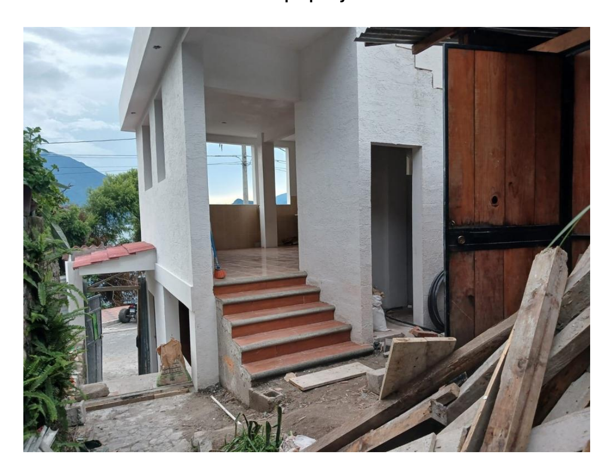
Stairs to top floor