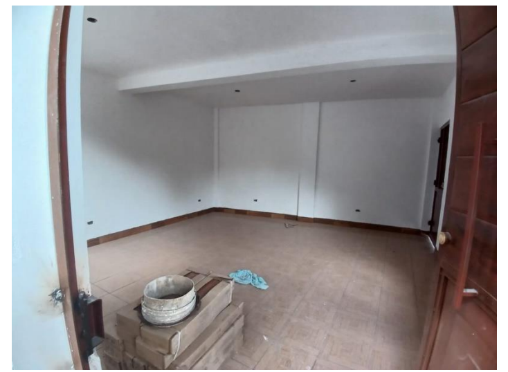
Kitchen – giving thanks for the new kitchen