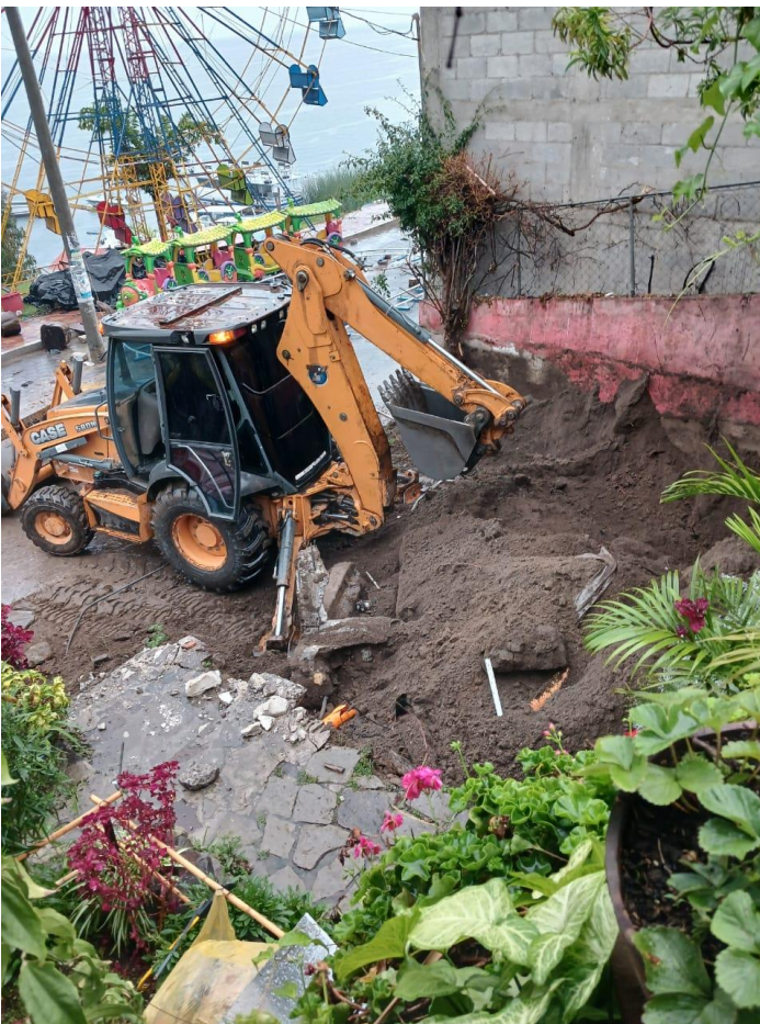
Casita Kitchen Building Progress Report August 2024